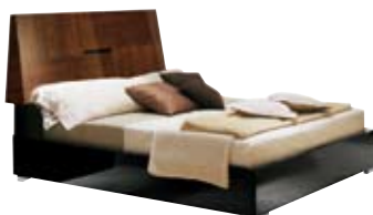
QUEEN SIZE BED PJSL0150 Inner size inch 61 1/2" x 81 1/2" cm 157 x 207

inch W 39" D 20" H 43" cm L 98 P 51 H 108,9 Crts 1 kg 70 m 3 0,665