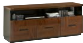
TV BASE PJS0612

inch W 21" D 23" H 41" cm L 51 P 56 H 103 Crts 1 kg 17 m 3 0,439