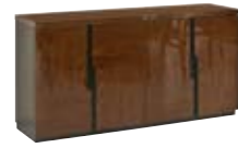
4/D BUFFET PJS0610 With 4 doors

inch W 67" D 19" H 34" cm L 169 P 48 H 85 Crts 1 kg 89 m 3 0,850