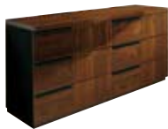
6/DRW. DRESSER PJSL0120 With 6 drawers

inch W 69" D 21" H 33" cm L 174 P 51 H 82,6 Crts 1 kg 94 m 3 0,897