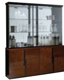
4/D CHINA CABINET PJS0605

inch W 39" D 20" H 72" cm L 97 P 50 H 181 Crts 2 kg 105 m 3 1,157