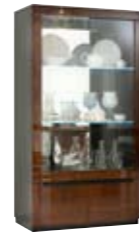
2/D CURIO PJSM0605EB With 2 glass doors, 2 wood doors, LED lights

inch W 79/100" D 42" H 30" cm L 200/255 P 105 H 76 Crts 2 kg 132 m 3 0,830