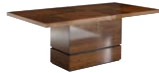
EXTEN. DINING TABLE PJS0615 With 1 leaf: W 100", cm 255 (1 leaf 21 1/2", cm 55)

inch W 67" D 19" H 34" cm L 169 P 48 H 85 Crts 1 kg 89 m 3 0,850